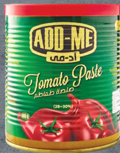
TOMATO PASTE SACHET