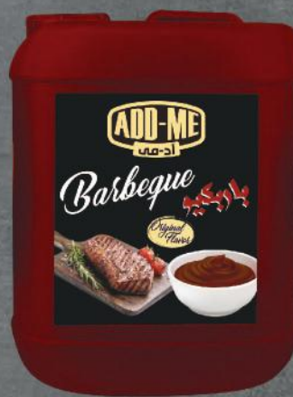
BARBECUE JERRY CONTAINER