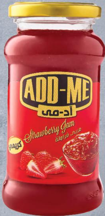
STRAWBERRY JAM JAR