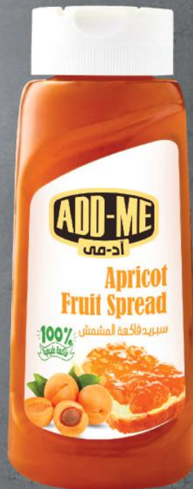
APRICOT JAM SQUEEZE