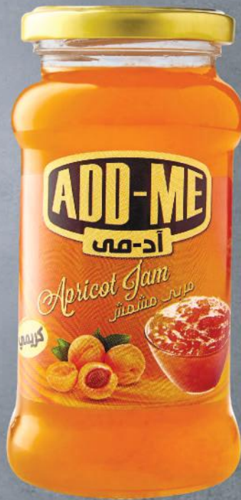
APRICOT JAM JAR