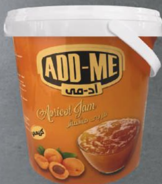
APRICOT JAM BUCKET