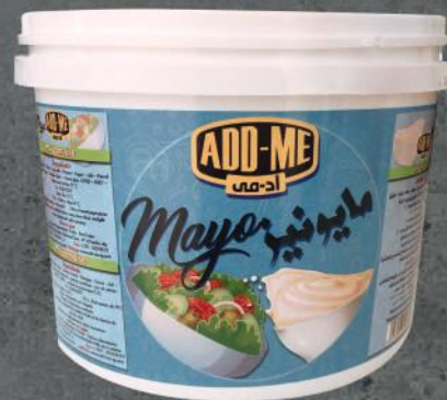
MAYONNAISE JERRY CONTAINER