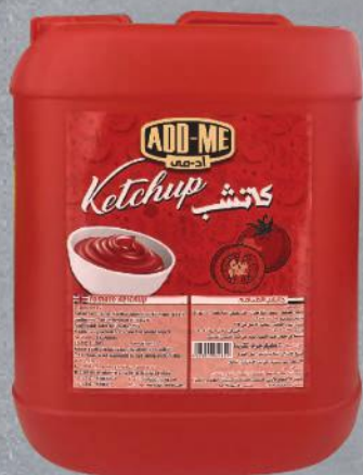
KETCHUP JERRY CONTAINER