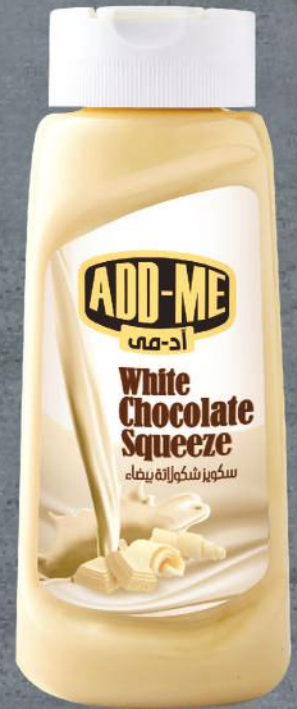
WHITE CHOCOLATE SQUEEZE