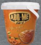
APRICOT JAM BUCKET