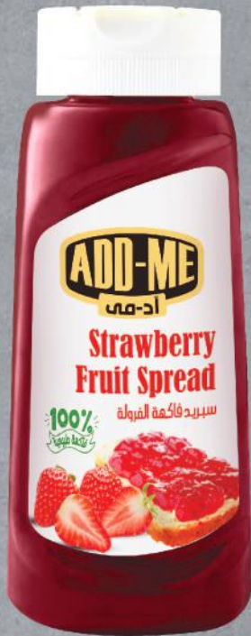
STRAWBERRY JAM SQUEEZE