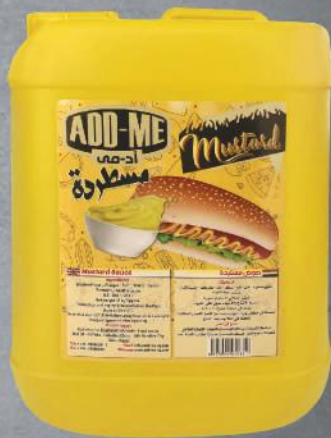
MUSTARD JERRY CONTAINER