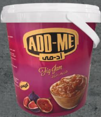
FIG JAM BUCKET