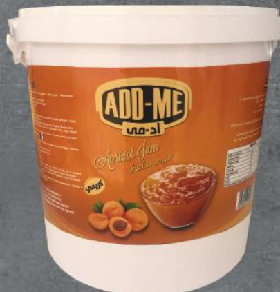
APRICOT JAM CONTAINER