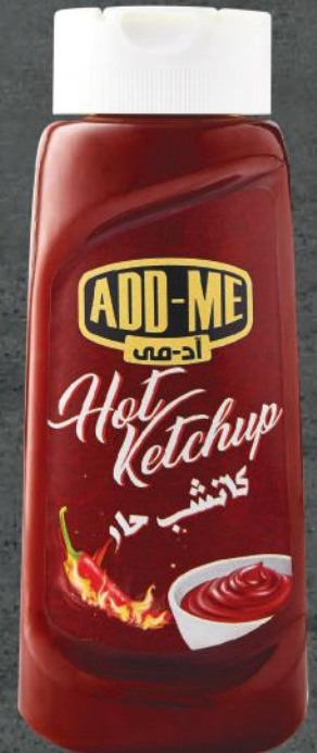
HOT KETCHUP SQUEEZE