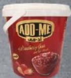
STRAWBERRY JAM BUCKET