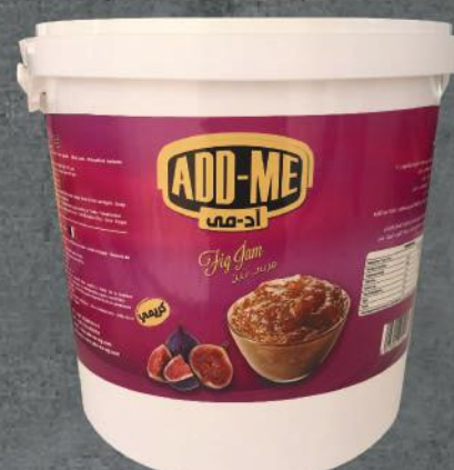
FIG JAM CONTAINER