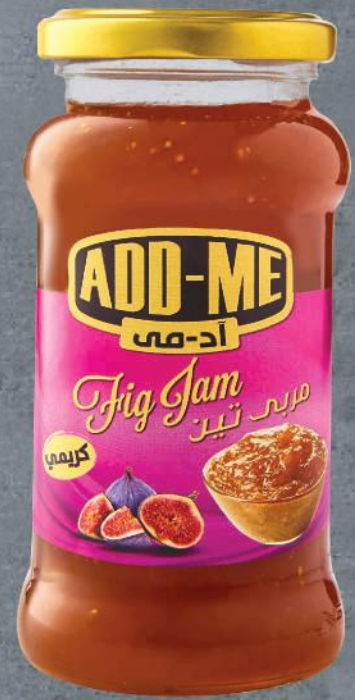
FIG JAM JAR