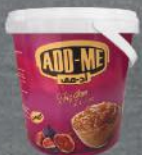
FIG JAM BUCKET