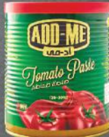
TOMATO PASTE TIN