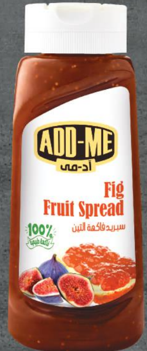
FIG JAM SQUEEZE