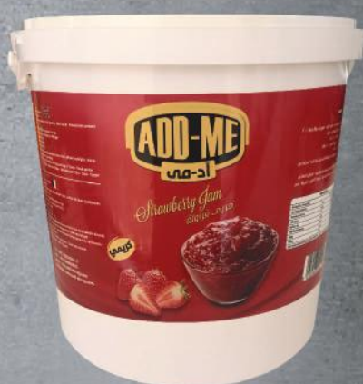
STRAWBERRY JAM CONTAINER