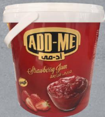
STRAWBERRY JAM BUCKET